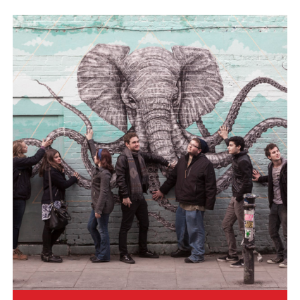
SPEND 4 UNFORGETTABLE WEEKS IN LONDON WITH FIE & The citadel